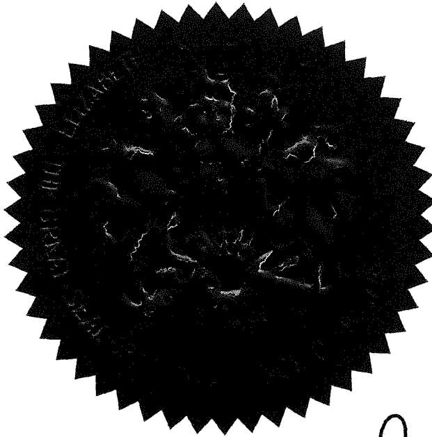
Attorney General and Minister of Justice (Counter signature for the Great Seal)